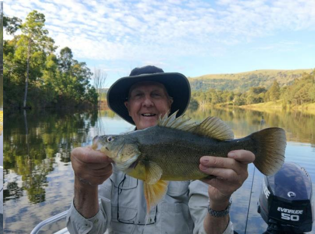
Yellow Belly at 43cm

After a few casts crunch, I hooked up solid just like the Bass earlier, so followed the same procedure and played the fish gently. It felt like a Bass, but to our surprise it was a nice Yellow-belly. It was close to 43cm so something different. Sometimes it's your day and today was mine.