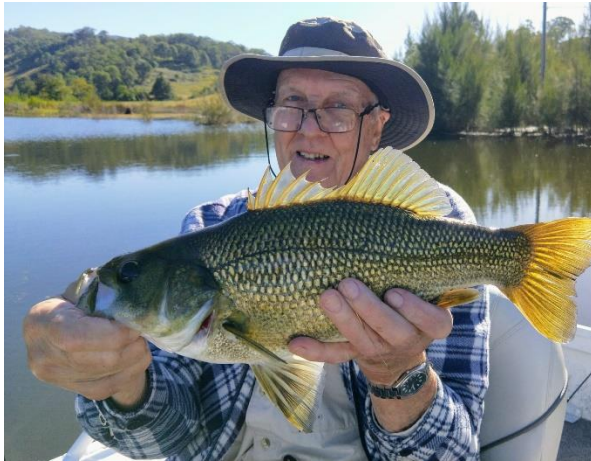
A lovely 42cm dam Bass