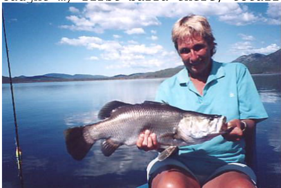
My first Barra!

We then took off to 1770 for a week very pretty good weather and scenery but fished out, managed to catch pike and bar tale flathead had trouble getting anything of size. Off to Lake Awonga where the camp overlooked the lake with a camp kitchen and fire next to our site. The weather was kind allowing us to use the electric most of the time but most important I caught my first barra there, totally stoked.