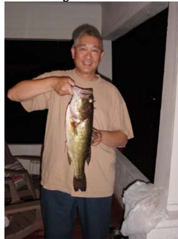
Mississippi Delta total catch